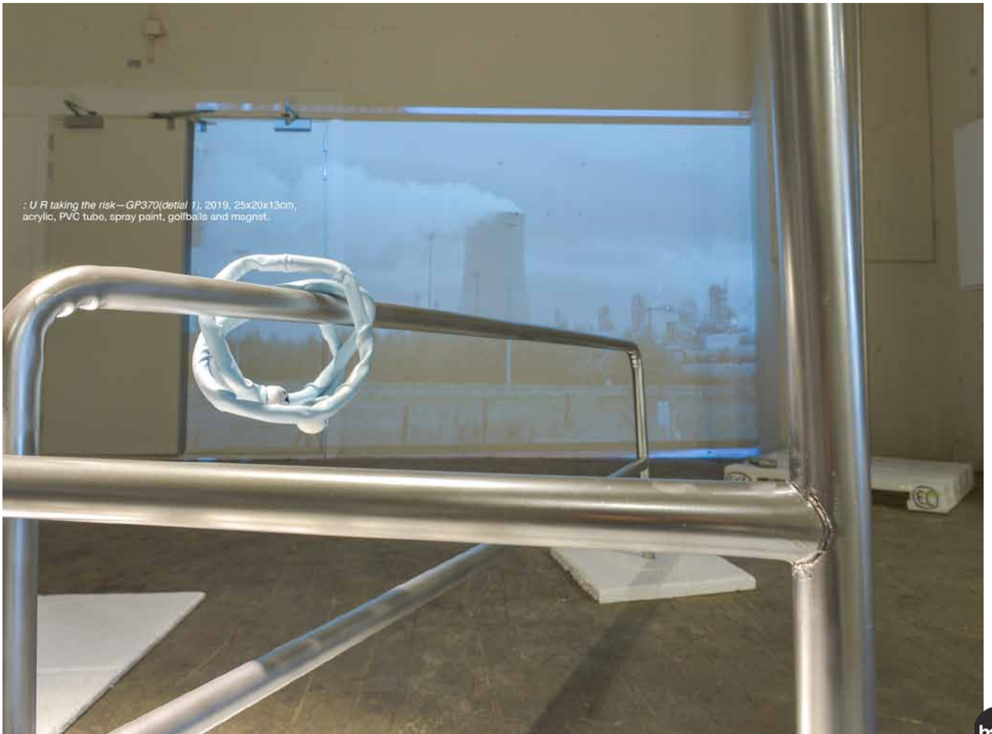
U R taking the risk—GP370(detail 1) , 2019, 25x20x13cm, acrylic, PVC tube, spray paint, golfballs and magnet.