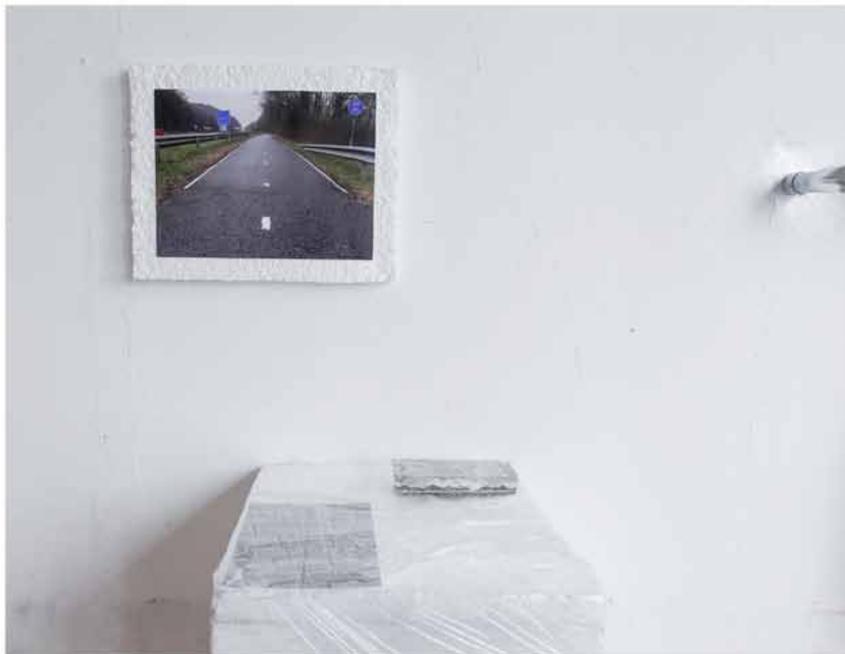
:U R taking the risk—Excess rectangle, 2020, 30x40cm(Photography) 22x9x4cm(Sculpture) Kodak digital printing, epoxy resin, gloves and foam.