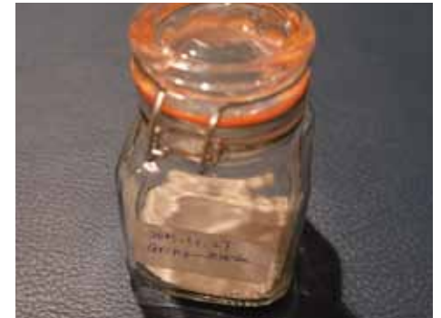
E. 51.368870, 3.366521-2g 2019. video and 2g salt, 2.38min https://www.instagram.com/tv/B7OMO1fllT6/