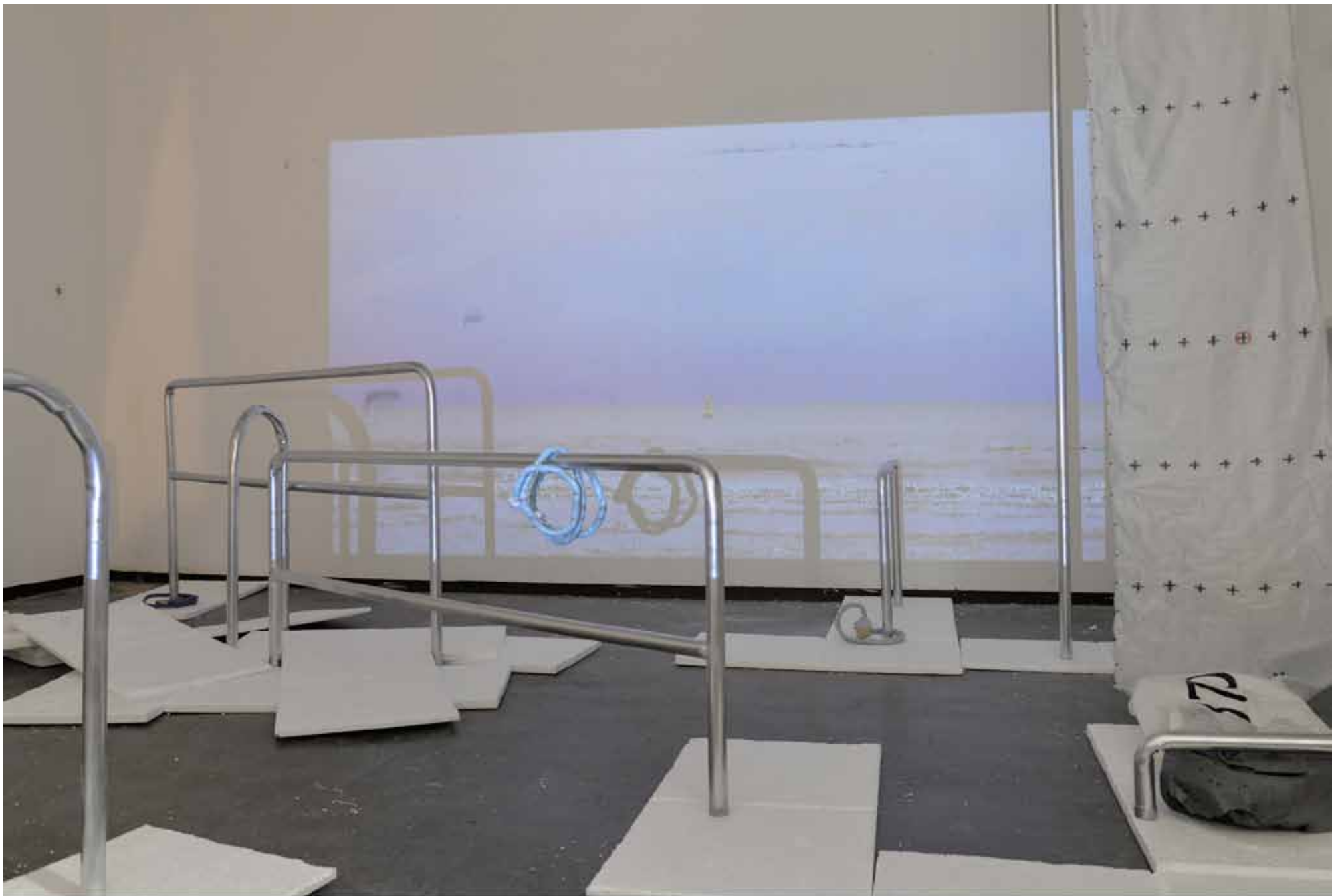
1. : U R taking the risk —GP370, 2019-2020, Installation 500x600x300cm(Size transformable), 9 piece of "fan" Foam, foam board, plastic, acrylic, PVC tube, spray paint, objects and a video.